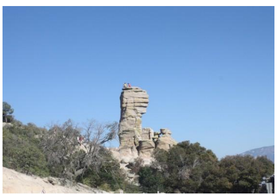
The Catalina Highway