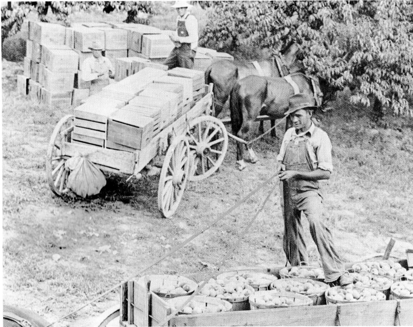
Two horse-drawn wagons loaded with peaches from one of the Sale Creek orchards are ready to be taken to the packing house for defuzzing, grading, packing, and shipping to distant markets. By 1930 there were over 200,000 peach trees in the Sale Creek orchards. This picture was taken in the late 1920's or early 1930's and was printed in a series of photographs about the Sale Creek peach business that appeared in the Chattanooga News-Free Press .