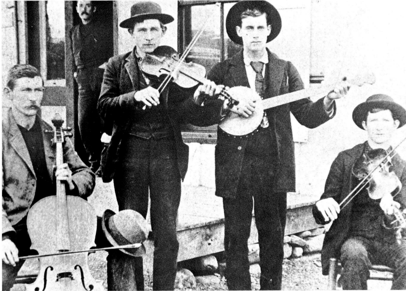
A group of musicians perform for the photographer in front of the Retro Post Office. The date was around 1895. None of the performers nor the onlooker are identifiable. Retro later became known as Bakewell, the name by which the community is known today.