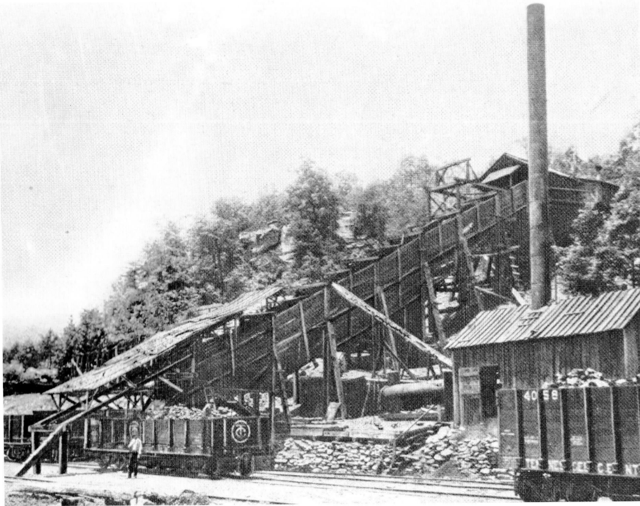
The coal loading tippie of the Sale Creek Coal and Coke Company as it appeared around 1900. It was located at the foot of Sale Creek Mountain.