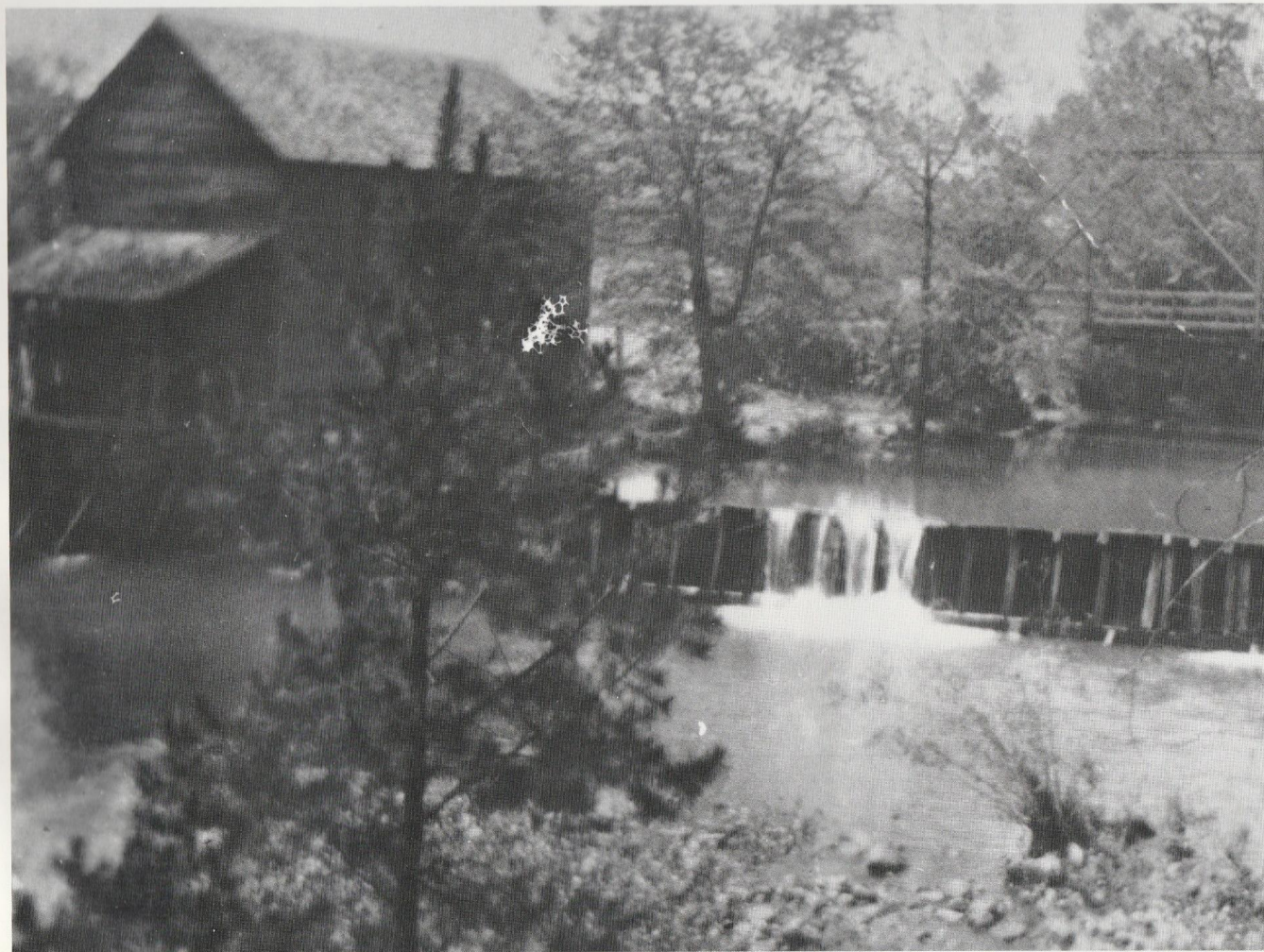
The Mill Dam - probably one of the most distinctive landmarks in Sale Creek's past - is pictured in this early 1900's photograph. During the 1930's a flood washed the old dam away. The mill was then torn down and two houses were built with the lumber.